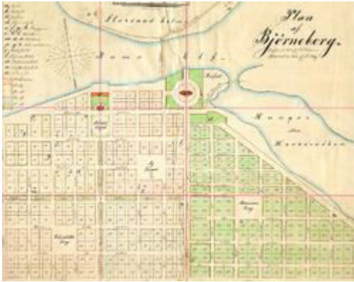
1852 city plan of Pori by G. T. von