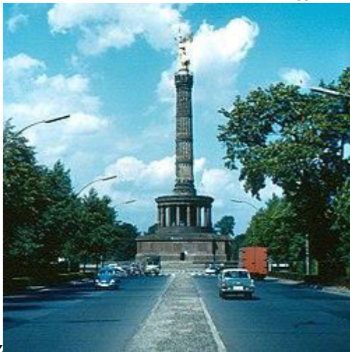
Berlin - Siegessäule. August 1963. Spacious and organized city planning in Germany was official government policy dating back to Nazi rule. [15]

There is evidence of urban planning and designed communities dating back to the Mesopotamian, Indus Valley, Minoan, and Egyptian civilizations in the third millennium BCE. Archaeologists studying the ruins of cities in these areas find paved streets that were laid out at right angles in a grid pattern. [16] The idea of a planned out urban area evolved as different civilizations adopted it. Beginning in the 8th century BCE, Greek city states primarily used orthogonal (or grid-like) plans. [17] Hippodamus of Miletus (498–408 BC), the ancient Greek architect and urban planner, is considered to be "the father of European urban planning", and the namesake of the "Hippodamian plan" (grid plan) of city layout. [18]