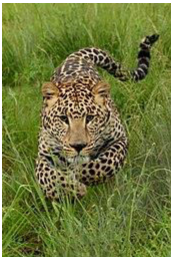
Charging Indian leopard.

The Sariska-Delhi leopard wildlife corridor or the Northern Aravalli leopard wildlife corridor is a 200 km long important biodiversity and wildlife corridor which runs from the Sariska Tiger Reserve in Rajasthan to Delhi Ridge. [39]