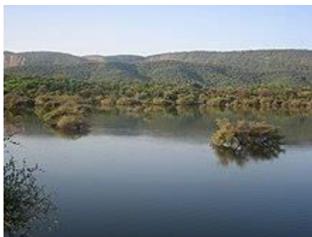
A lake nested within Aravali Hills.