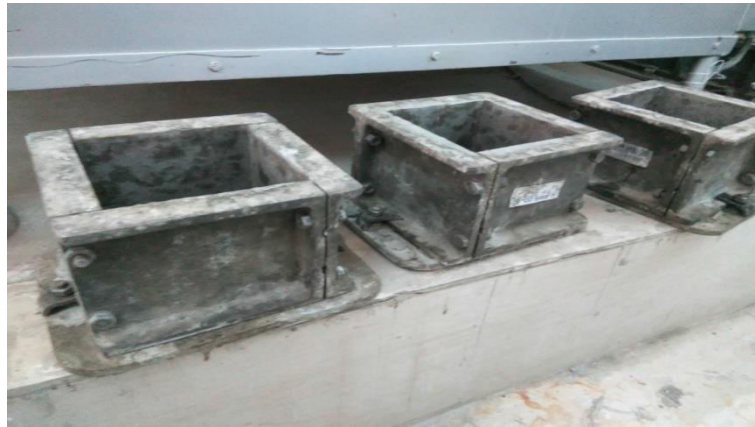
Fig.1 Compressive Strength testing mould