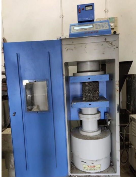
Fig.2 Universal Testing Machine

In pervious concrete we are performing two conditions as;