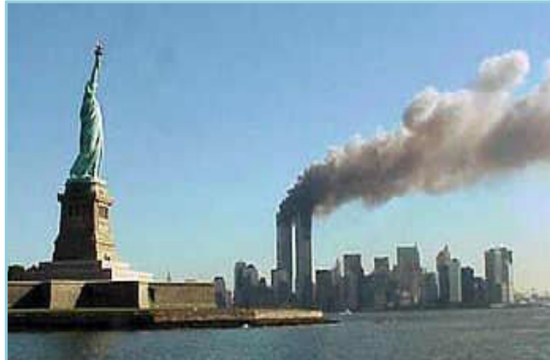
FIGURE 3: Pollution on Statue of Liberty