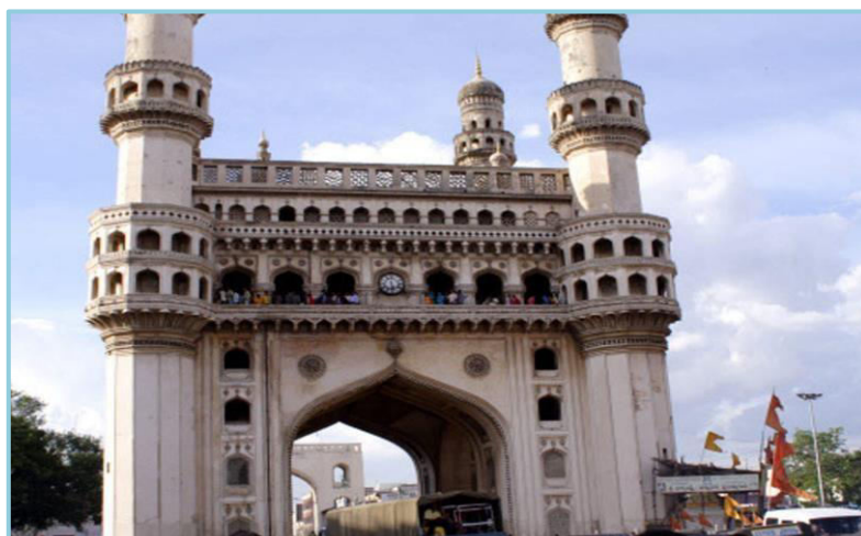
FIGURE 2: Air cracks on Charminar