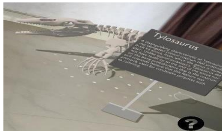
Fig3: Entertainment Section (Tylosaurus Model)