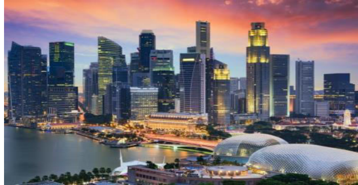
Figure4: Virtual Singapore

It contains the exact dimensions of every building, where the windows are located, and even what it's built out of. Think of it like Google or Apple Maps' 3D modes, but with the ability to enter every building and see its layout. On its own, the model will be impressive, but it's when sensor data is fed in that things get interesting, offering an unparalleled view of the city.