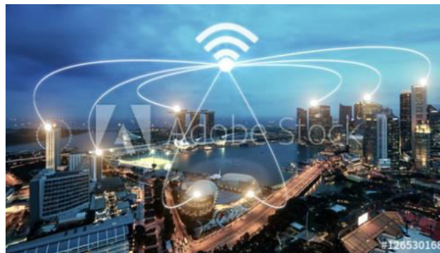
Figure3: Singapore the smartest city on the Earth

Singapore's unique geopolitics are key to positioning itself as a living laboratory. All these ideas can be tested, and potentially commercialized, without the usual difficulties of regulatory approval. Rolling them out worldwide will be more difficult, for sure, but Dr.Balkrishnan believes the initiatives can be "customized and applied to other cities around the world." While it's difficult to see New York City putting satellite-navigation devices into cars, there are ways similar data could be collected. The world is pushing rapidly toward autonomous vehicles, and within the decades, it's likely that the majority of cars will be collecting far more data on their environments and traffic conditions than they are now. It's not impossible to see a future in which this data is anonymously aggregated and used to improve our road layouts and traffic flow.