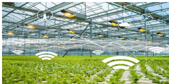
Fig.1 Greenhouse using IOT

The Internet of Things is an emerging subject of technical, social, and economic significance. Nowadays, the IOT enabled devices are widely used in the control and monitor systems of the agriculture industry [7]. The IOT technologies comprise of sensors, actuators, cloud computing based data amenities, drones, navigation and analytical system, which allows the architecture to make intelligent decisions to extend the crop yield [7]. IOT connects devices through networks and tracks performance of those devices from anywhere. A large amount of communication devices in the IoT are embedded in to sensor devices within world [3]. Sensor plays a very important role in IOT technologies.