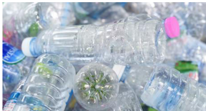
Fig.5.B.1 Plastic bottles

Plastic is a waste material in environment is a long-term usage . It can lead to toxic chemical into air , water , soil which cause health problem to environment . Hence it is necessary to reuse waste plastic to decrease this danger . When plastic waste is molten it acts as a binder as it is used in construction . It increases mechanical properties of road and decrease the construction cost .