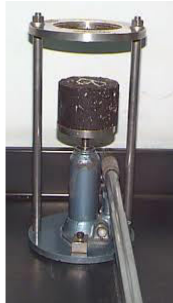
Fig.7.1.1. Marshall stability equipment

The aggregate taken in use has been passed through 12.5 mm sieve . Bitumen tests the grade as 60/70. The bitumen heated in a pan till It melts . The calculated amount of plastic was added in bitumen . It is mixed for 2 min. this mixture mixed up to the aggregate coat with it that mixture take out and placed it of diameter and height in three layer , 50 blows were given after each layer. The sample taken out from it after 6 hr and placed side for 24 hr . After 24 hr these sample takes to conduct marshell stability test , note the reading of each sample and compared with the standard reading of bitumen concrete.