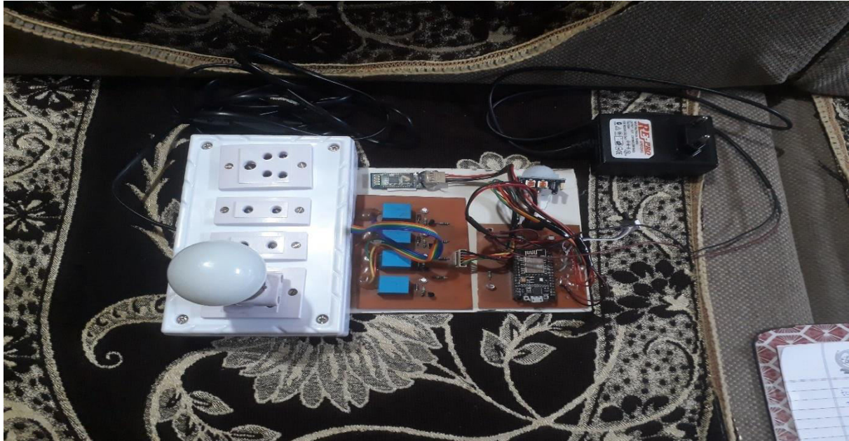
Fig.2 Hardware Design