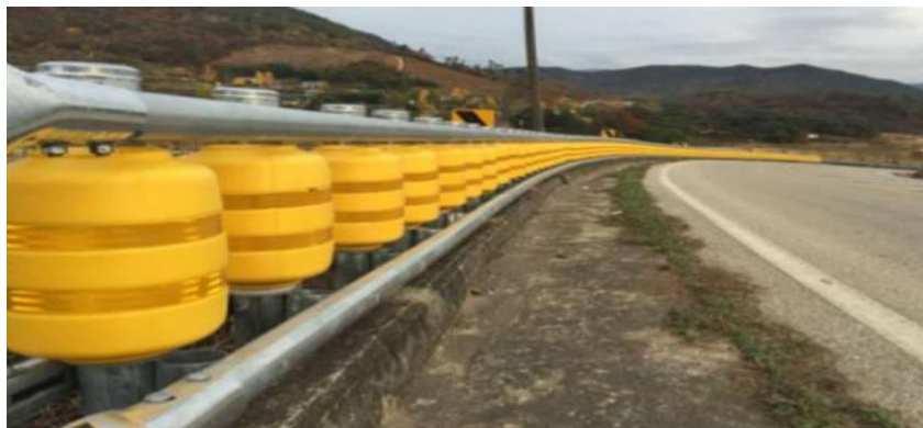
Fig1.1 Rolling Barrier

50 percent in a year. In a strength performance test of the 8-ton truck, and in a passenger protection test with 1.3-ton passenger car, the RB satisfies the MOCT's Guidelines for Installation and Management of Road Safety Facilities. Outcalt (2001) reported on milled rumble strips installed at the centreline of a 27-km two-lane section of State Highway 119 in Colorado. He found that the rumble strips reduced accidents per million vehicles by 34% for head-on collisions and 36% for sideswipe accidents. This research aims to evaluate the effectiveness of In Lane Rumble Strips and Rolling Barrier against head-on collisions and safety measures.