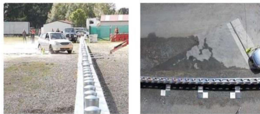
Fig1.3 Mash 4-10 Testing