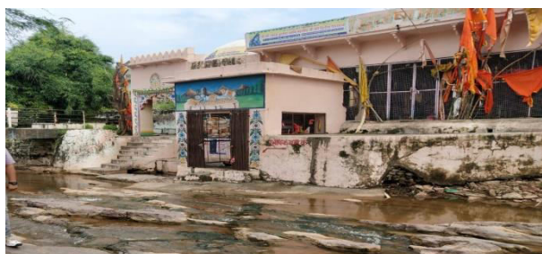
Fig. 3 Saint Durvasa ancient Shiv Temple surrounded by sacred grove