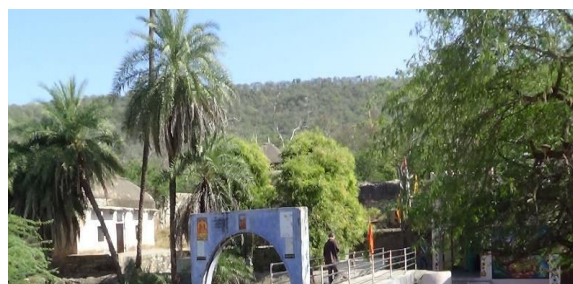
Fig. 4 Saint Durvasa sacred grove

Lakdeshwar Mahadev sacred grove is situated near Petch ki bawari on the bank of the Mej River. This area is one of the most ancient places of Bundi district. The ancient Shiv temple, dense forest area, and Mej river attract the