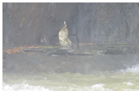
Fig. 2. Ancient Shiv Idol (Naidia sacred grove)