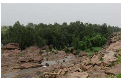
Fig. 1. Dense sacred grove (Naidia, Nala-Daha)

Naidia (Nala-Daha) is situated in south part of Bundi district between 25° 13'52.747" North Latitude and 75° 30'57.298" East Longitude in Loicha gram panchayat, tehsil Bundi district Bundi. Naidia (Nala-Daha) is located 30 km away from district headquarters. This place is on Upper mall plateau. The climate of the area is semi-humid. The average annual rainfall is 800 mm with 90% rainfall between June to September. This place is full of natural and geographical beauty. Flow of the water on rocks is the centre of attraction. Inside the Naidia waterfall, there is an ancient Shiv temple. The forests surrounding this area are known as religious and sacred forests. Many tribal, local, and nomadic communities are found near this area which protects and worship these sacred forests. In this forest along with the waterfall, there are many Jamun trees. The area is well dominated by waterfalls as well as Jamun trees. This area is also known as the Jamun forest. The forest also consists of Terminalia arjuna (Arjun), Anogeissus pendula (Dhokara), Azadirachta indica (Neem), Ficus benghalensis (Bargad), Ficus religiosa (Pipal), Acacia nilotica (Babool), Dalbergia sissoo (Shisham), Butea monosperma (Dhak), Ziziphus mauritiana (Ber), Mitragyna parvifolia (Kadam), etc.