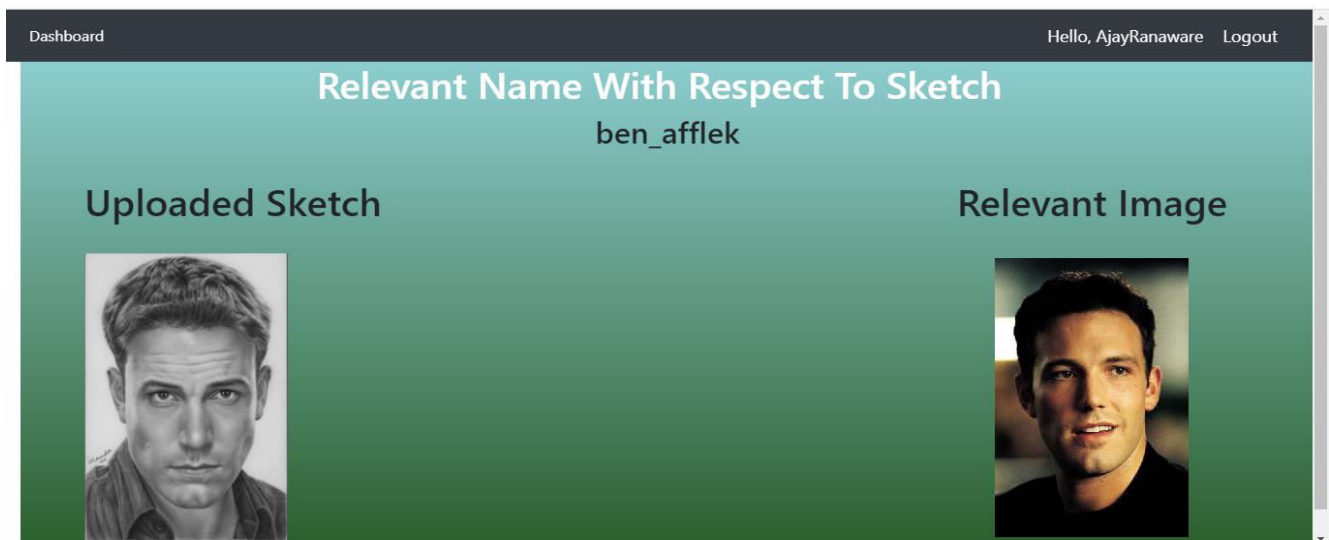
Figure 4: Output Image

These images were then divided into two subcategories; among which 192 predicted and 22 not predicted respectively. The figure shows the predicted image with respect to sketches and recommends the image for it. We classified image data into predicted and not predicted categories based on the accuracy factor which is our main motive.