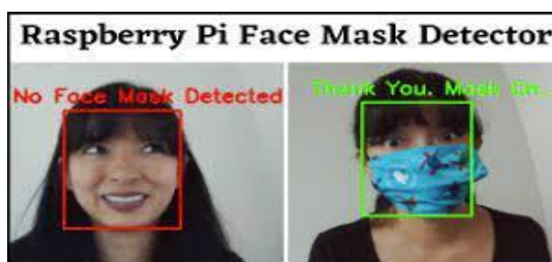
Fig 3. Face Mask Detection