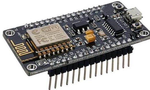
Figure4: ESP8266 WiFi Module/ Node MCU.