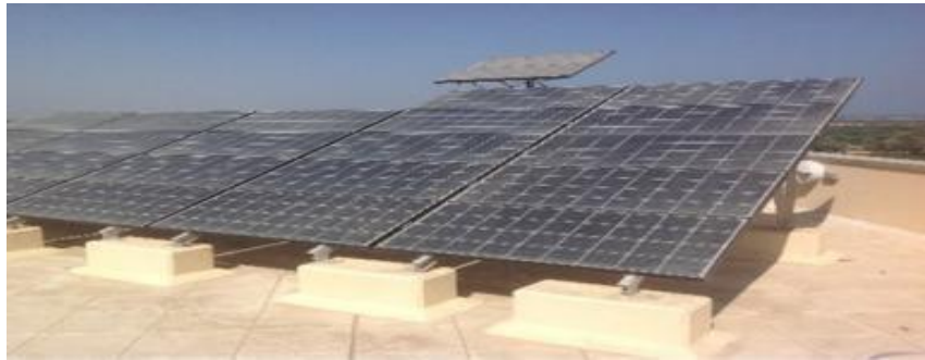
Figure1: Solar module covered by heavy layer due to dust accumulation before cleaning.

Many researchers had made many studies in this major problem and proved that 50% of the PV solar panels performance reduces by the dust accumulation on the cleaned panels.