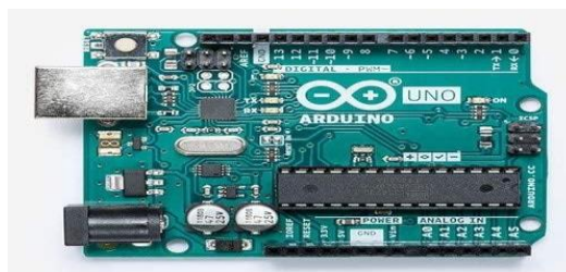
Figure 3: Arduino.

The digital and analog input/output pins equipped in this board can be interfaced to various expansion boards and other circuits. The Serial communication interface is a feature in this board, including USB which will be used to load the programs from computer.