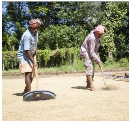
Fig 1, Sun drying (Ref.7)

Grain drying could be simply be described as the process of removal of the moisture content from grain. It is an ancient process used to preserve agricultural grains. Most of our agricultural crops contain high amount of water content in them which needs to be removed for long term storage. [5] Study reveal that the higher the level of moisture or water content present in a grain greater would be the number of microorganisms growing on it. When the moisture content is less than 10%, the possibility of any microorganism growing on it is close to nil. [6]. Drying consists of many different ways. Both natural and forced methods of drying are practiced in different regions of the world. In India sun drying is the most common practice followed. [7]