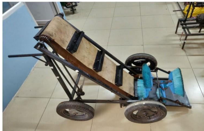
Fig 3 Grain collector (Ref.1)

The components of the grain collector are wheel, sprocket, brush, frame, chain drive, conveyor belt. As the machine is moved manually, the grains are collected at the front portion using the rolling sweeper. A parallel shaft is