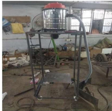
Fig.6 design and fabrication of vacuum based grain collector with load cell (Ref.3)

A vacuum based grain collector which collects the grains from concrete area or ground by suction process. The important components are Frame, V-plate, vacuum cleaner, load cell and wheel. Machine is electrically operated. As the machine is moved, grains are collected by V-plate. Due to vacuum, hose sucks the collected grains and are filled in the dustpan. When the machine is switched off, valve fixed below the dustpan gets opened and grains directly fall into the collecting bag. Load cell fixed below the load bag will determine the weight and displayed automatically in the LED display. [4]