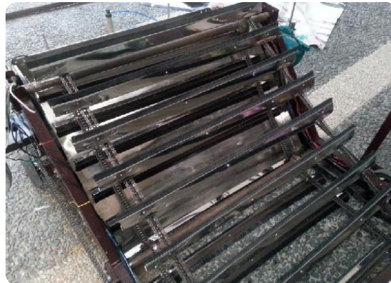
Fig 4. Design Implementation of a Tedding Mechanism for Grain Sun Drying (Ref.21)

This design is similar to the sweeper wheel design. The components of this model include belt, brush strips, metal ridges, conveyor. L-bars are used as conveyor flaps with brush strips at the longer side. These brush strips are secured by rivets. As it moves forward tedding process takes place. This means function of spreading the heaped grains into an uniform layers of grains. The model not only distributes the grains but also used for collecting the grains when moved in the opposite direction. [21]