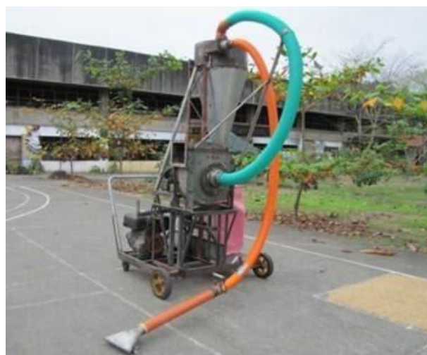
Fig.7 Design, Fabrication and Performance Evaluation of Mobile Engine-Driven Pneumatic Paddy Collector (Ref.4)

An engine driven pneumatic paddy collecting machine which runs on diesel powered engine. Radial flat bladed centrifugal blower, cyclone separator, frame and wheels are the major components of the paddy collector. The centrifugal fan provides suction to collect the paddy and conveyed by an intake air stream through suction nozzle. As the air-paddy mixture enters the cyclone separator through flexible hose, they get separated. Paddy moves downwards