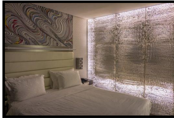
(Fig.9 Transparent Concrete Bedroom)

9. Illuminating speed bumps on roadways at night.