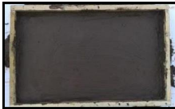
(Fig. 7 Preparation of panel)

A mould of rectangular cross section of size 150mm*150mm*150mm is made with wood or steel. Make the required size of rectangular mould from wood or tin. Place the clay or mud in the sides where the optical fibers are exposed to the mould for the easy demoulding after the concreting.