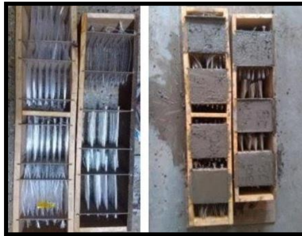
(Fig.6Preparation of mould)

important to fix the basic dimensions of mould. The standard minimum size of the cube according to IS 456-2000 is 15cmx15cmx15cm for concrete. In the mould, markings are made exactly according to the size of the cube so that the perforated plates can be used. Plates made of sheets which are used in electrical switch boards is used which will be helpful in making perforations and give a smooth texture to the mould, holes are drilled in to the plates .The diameter of the holes and number of holes mainly depends on percentage of fiber used.