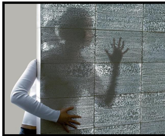
(Fig.3 : Transparent Concrete Wall)

The main purpose of transparent concrete is the maximum used of sunlight and reduce the electric power consumption and using the optical fiber to sense the stress of structure.