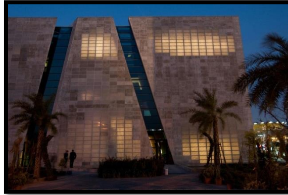
(Fig.1: Transparent Concrete Building Concept)