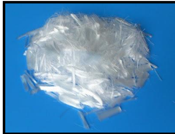
(Fig.5: Optical Fibre)

Water: Water should be free from acids, oils, alkalis vegetables or other organic impurities. Soft waters also produce weaker concrete. Water has two functions in a concrete mix. Firstly, it reacts chemically with the cement to form the cement paste in which the inert aggregates are held in suspension until the cement paste has hardened. Secondly, it serves as a lubricant in the mixture of fine aggregates and cement.