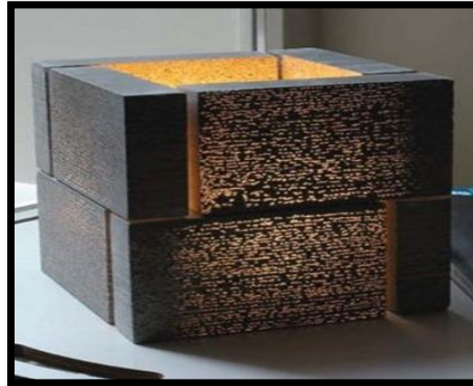
(Fig.2 Transparent Concrete Block)

Transparent concrete is used to provide a better aesthetic view of a building or other architectural purposes.