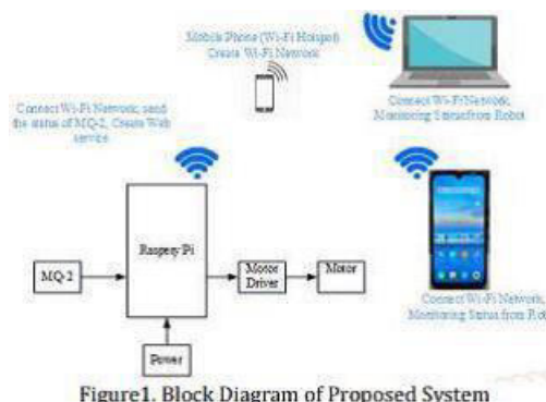
Figure1. Block Diagram of Proposed System

The block of the proposed system is as shown in figure 1. From the figure 1, there have the two portions to implement the system that they are hardware and devices . In the hardware portion, the Raspberry PI 3 is the main control International Journal of Trend in Scientific Research and Development (IJTSRD) .The MQ-2 is sensing the gas and send the signal to the PI3. The motor is used to move forward, backward and other direction of sensor . The direction command is received by PI 3 form the PC or mobile phone through GSM network. The status of leakage gas can be monitored on PC or Phone with web server via GSM. to implement the whole function of the system, PI3 os.