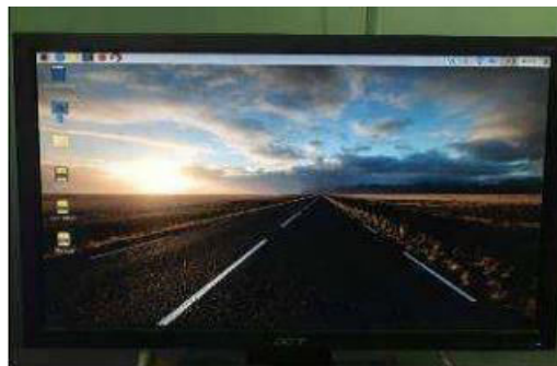
Figure7. The Raspberry Pi's Operating System Raspbian (desktop view)

Raspbian is a Linux distribution based on Debian created specifically for the Raspberry Pi (Raspbian, 2014). This operating system was chosen for this study for its compatibility with the Raspberry Pi hardware. The Raspberry Pi has an ARM processor which is incompatible with some other architectures. Raspbian comes with Python installed on the operating system already. Python is heavily used in image processing and web integration in this study.