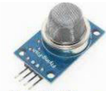
Figure6. MQ-2 Sensor

meaning the digital output pin will be 0V. Now, introduce the sensor to the gas you want to detect and it should be seen the output LED to go high along with the digital pin, if not use the potentiometer until the output gets high. Sensor can be introduced to this gas at this particular concentration the digital pin will go high (5V) else will remain low (0V)[9]. After setting up the hardware, the software is needed to run the system properly. The software may be PI3 OS, Python and web server. There are many OS for PI3. In this system, Raspbian is used. It is installed on the SD card that is inserted in PI3 card slot.