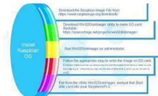
Figure2. Installations steps of Raspbian OS