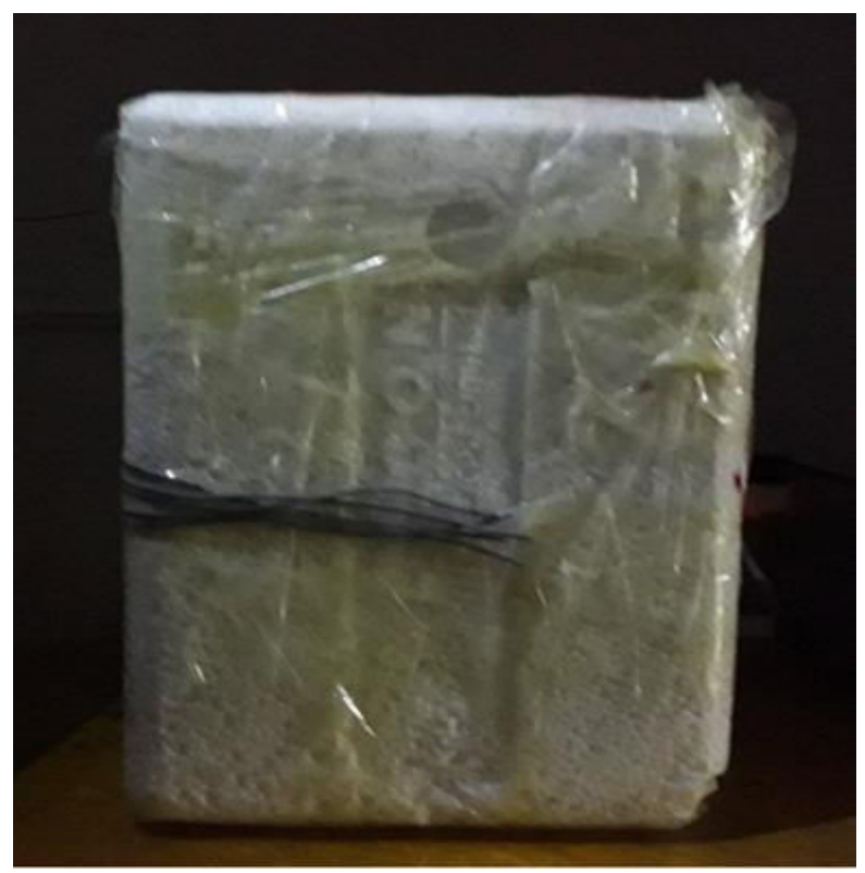
Fire extinguishing device

An activation or trigger strip is implanted into the ball's outer casing. It firmly holds the dry fire extinguishing agent inside. When the activator or trigger is exposed to flames for more than a few seconds, the casing will burst open and disperse a cloud of chemical powder in the surroundings.