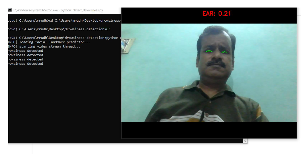
FIGURE NO 4 DROWSINESS DETECTION