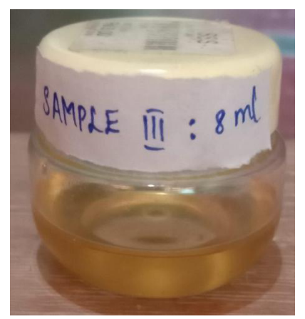
Figure 3: Oil extracted from Sample III