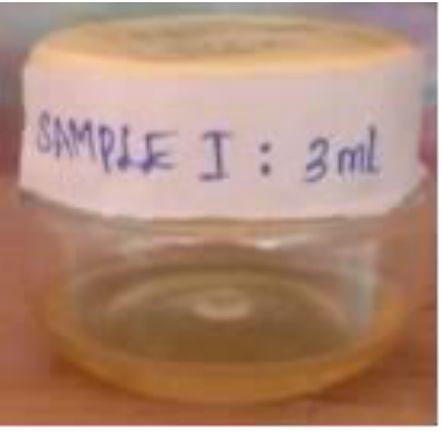
Figure 1: Oil extracted from Sample I