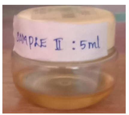
Figure 2: Oil extracted from Sample II