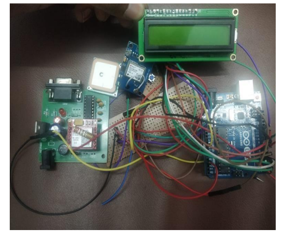
FIG 1: Experimental setup