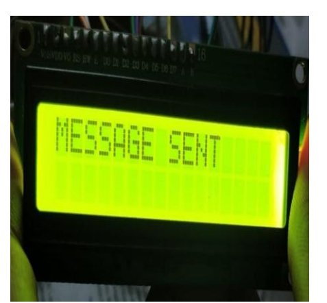
FIG 3: LCD output after sending message