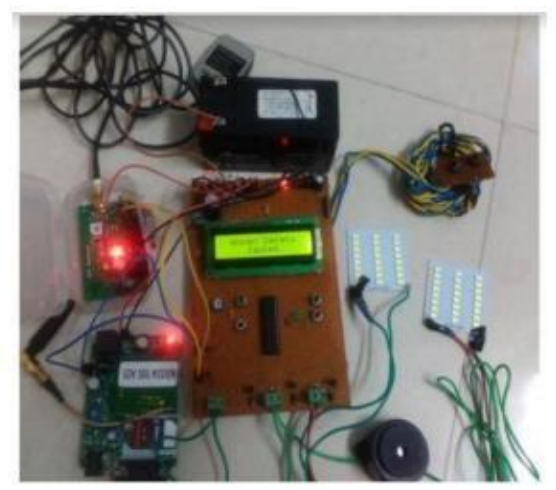
FIG 2: When panic button pressed