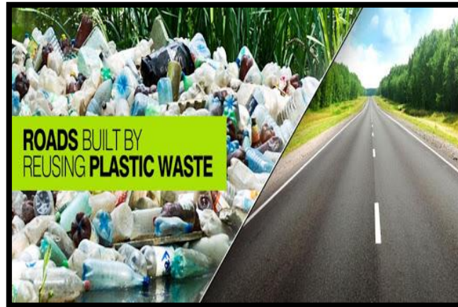
(Fig 1: Plastic waste for Road Construction)