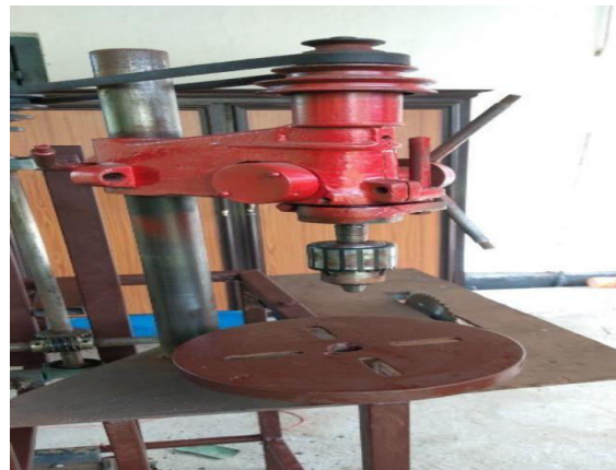
Figure 5.3: Drilling Mechanism