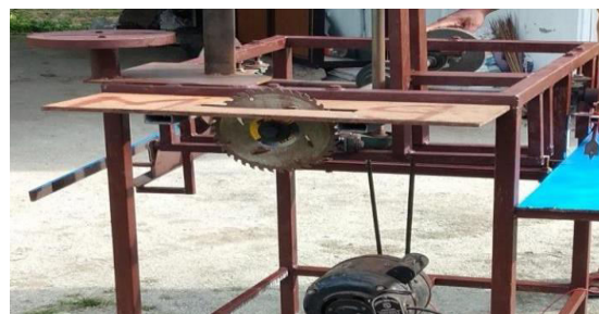
Figure 5.4: Cutting Mechanism