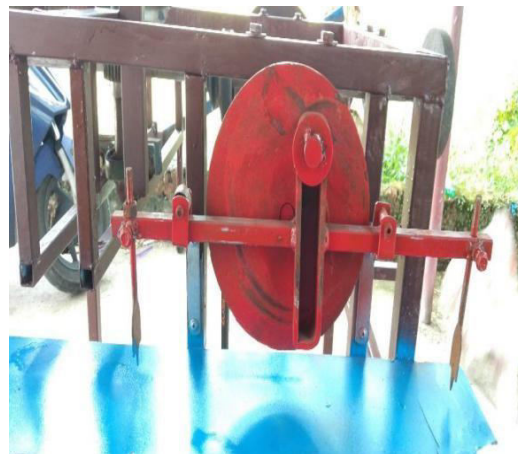
Figure 5.1: Scotch-yoke Mechanism