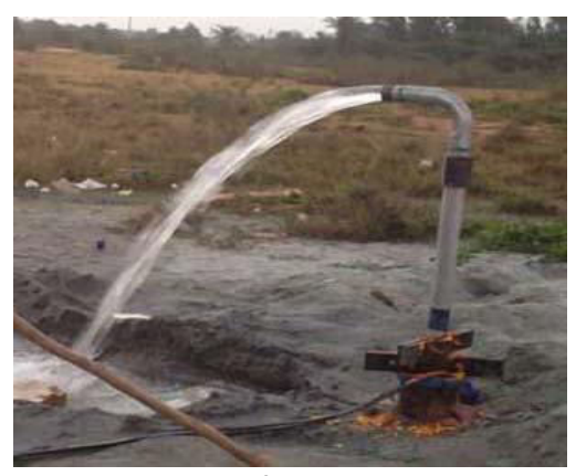
Sampling from bore well

5. Sulphate: The sulphate ion is one of the major anions occurring in natural water. Sulphate in most of the samples was found to be lower than highest desirable level i.e., 200 mg/L. Sulphate was found in the range of 30 to 80 mg/L, which is also within limit. Higher value of sulphate may cause intestinal disorder. [7]