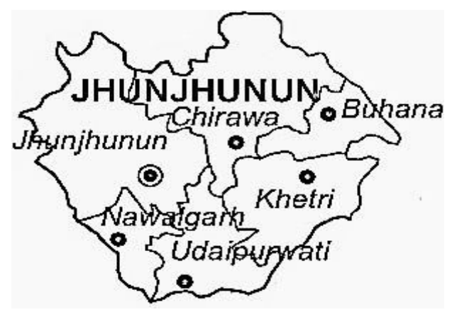
Jhunjhunu district guide map, Rajasthan

The present study provides a detailed description of the chemical criteria of ground water. Ten representative samples of entire study area were collected and analyzed for pH, total dissolved solids (TDS), fluoride, chloride, nitrate, sulphate, total alkalinity, total hardness. The sampling sites were identified and then the samples were collected from different sources after allowing some amount of water to flow out. The samples were collected in clean plastic bottles, which were pre cleaned, dried in dust free environment and sterilized.