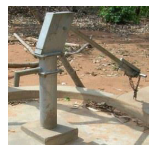
Sampling from handpump