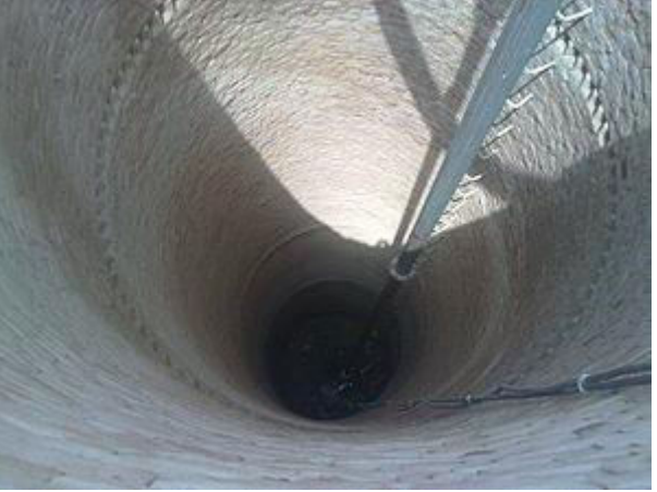
Sampling from tube well

4. Chloride: Chloride contents in fresh water is largely influenced by evaporation and precipitation. 12 Chloride is the most trouble some anion in the irrigation water. They are generally more toxic than sulphate to most of the plants and are best indicator of pollution. 13-14 Chloride contents varied from 175 to 325 mg/L in all the samples, which is all in the limit. [6]