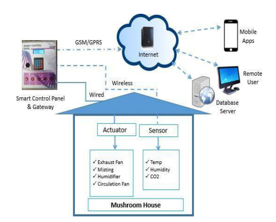
Figure 2. A WSN for Greenhouse Monitoring [11]

IoT technologies in a greenhouse provides benefits to growing plants using "anytime and anywhere" concept. Monitoring, controlling and tracking in a greenhouse requires high precision since the cultivation taking place in a controlled environment. Deployment of IoT technologies in greenhouses have minimized the human resources, optimize resources (e.g. water, fertilizer etc.), increase yield and provides direct link between farmers to customers [9-10].