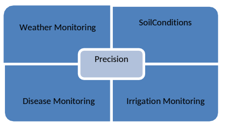
Figure 1. IoT in Agriculture Applications

Precision agriculture helps to improve the livelihood of the farmers by automating and optimizing all feasible agricultural parameters in order to enhance the agricultural cultivation and productivity. IoT sensors help to measure soil quality, weather conditions, moisture level, and finally optimize these parameters to increase the yield.