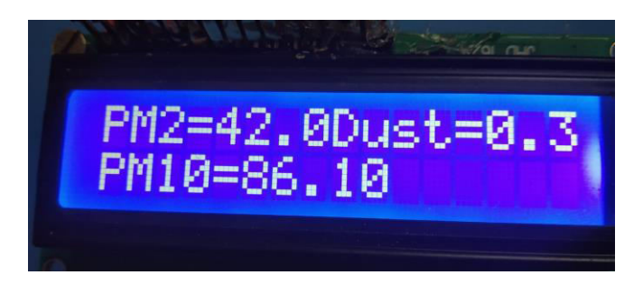
FIGURE 3: when the particle concentrations and the dust particle is present