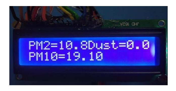
FIGURE 1: when no input is given

This project will be used to measure the particle concentrations of PM2.5, PM10 and dust particle density in the air and the data can be successfully implemented and will be displayed in LCD.