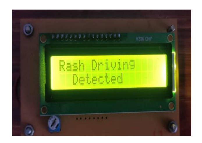
FIGURE : EXPERIMENTAL SETUP FIGURE : EXPERIMENTAL RESULT