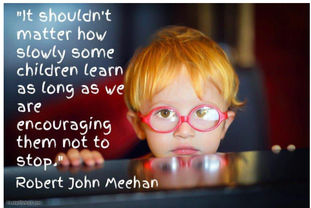
It has also been suggested that positive teacher attitudes are dependent upon the classroom teachers' beliefs about implementing inclusive educational policy and practice into the classroom. Since the mere acceptance of inclusion is likely to affect the teachers' commitment to its implementation, teachers' beliefs and attitudes are critical to ensure success.[r]

Negative attitudes towards inclusion are linked to teachers' frustrations towards their own abilities to teach in an inclusive classroom. While professional development workshops are found to positively impact teachers' abilities to teach student with specific learning disorders, they are not always offered. In addition to frustration, teachers' feelings of fear are linked to not knowing[s] "how best to incorporate students with disabilities into the regular education environment", which serves as a barrier in preventing "full inclusion". It was found teachers who were less inclined to include special needs students in their classrooms also expressed greater concern for students' educational success. This paradox leads teachers "to be less proactive in effectively supporting them".[g]