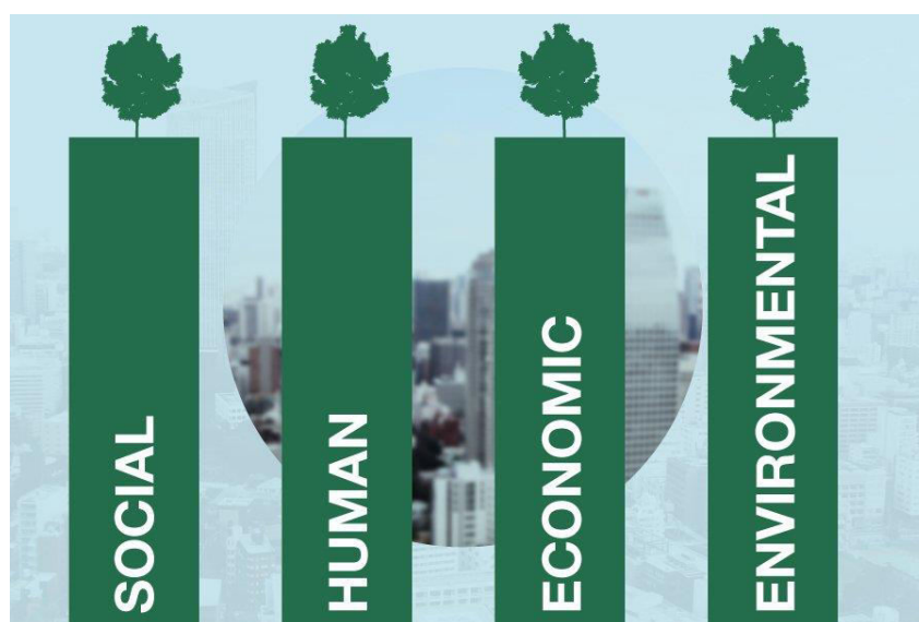
The four pillars of sustainability