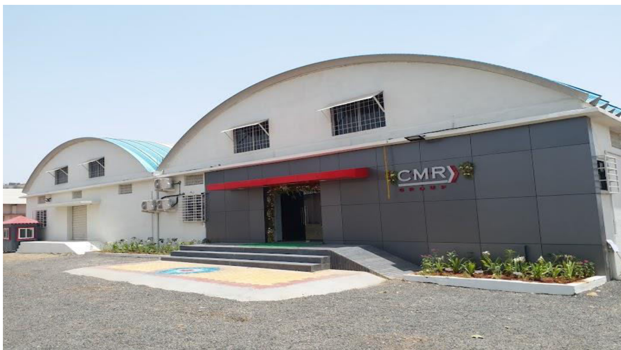
Fig. 1.Site Picture