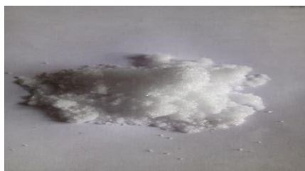
Fig (f) Magnesium sulphate