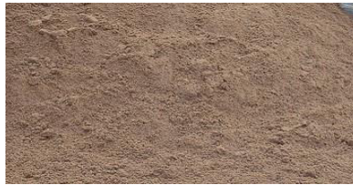
Fig (b): Natural sand