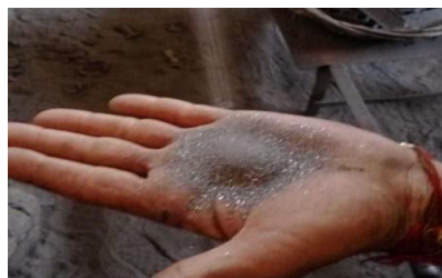
Fig (d) Waste foundry sand

SUPER PLASTICIZER- Super plasticizer is also defined as water reducer and these are used in making or production for high grade concrete. Super plasticizers reduce 30% of water content in concrete and it decelerate the curing time of concrete. They effectively improve the performance of fresh past of concrete.