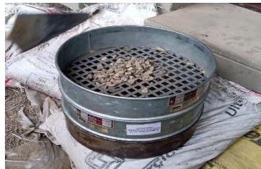
Fig (c) Coarse aggregates