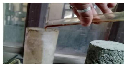
Fig (e) Super plasticizer

SUPER PLASTICIZER- Super plasticizer is also defined as water reducer and these are used in making or production for high grade concrete. Super plasticizers reduce 30% of water content in concrete and it decelerate the curing time of concrete. They effectively improve the performance of fresh past of concrete.