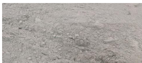
Fig a) Portland pozzolana cement (PCC)