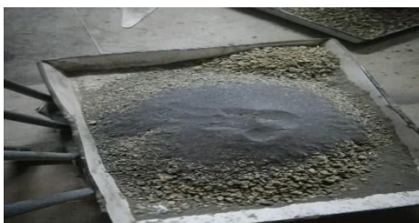
Fig (g) Addition of waste foundry sand in concrete mix