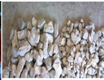
Fig. (b). Recycled Concrete Aggregate

First of all collect the demolished material cement, sand, aggregate and polypropylene fiber. Then all waste material are mixed with proportion according to IS 10262. The proportions are 0%, 15%, 25% and 35% and polypropylene fiber is 15% of cement volume are mixed and then mould are made to cube for compression and cylindrical for tensile strength test. After that the rest on the watertank for curing and curing days are 7 th , 14 th and 28 th after that tested by UTM as compression and tensile strength.