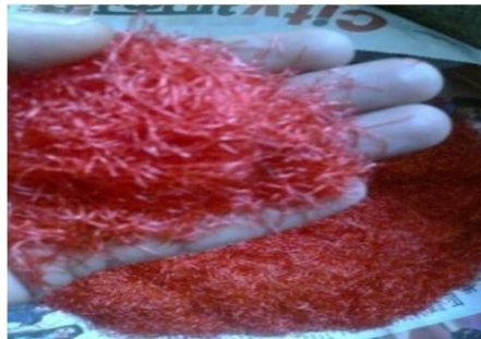
Fig (a). Polypropylene Fiber

The fibres are used either as short size and discontinuous fiber material for production of fiber reinforced concrete. Polypropylene twine is abundantly available, alike all manmade fibers of a consistent quality and cheap also. The fiber is cut into size 6mm length.