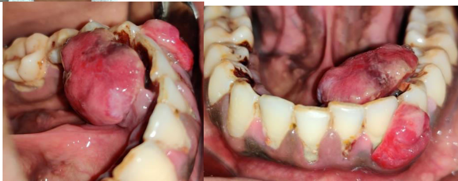
fig 2 and 3: Intraoral examination