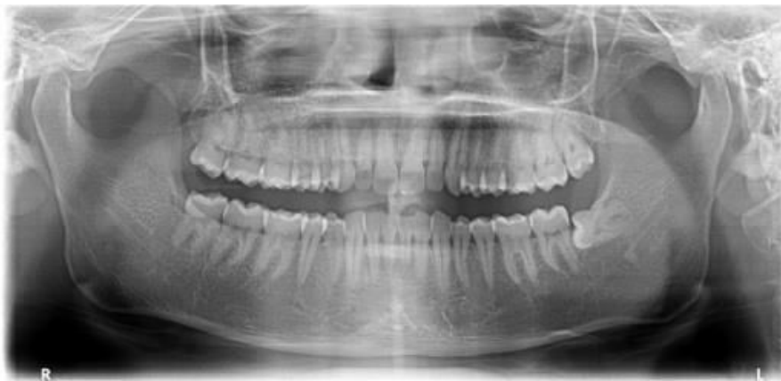
fig 4 : OPG reveals no abnormality