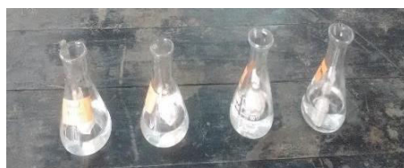
Fig 2: compound packed in membrane