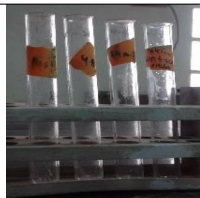
Fig 3:Remove membrane content in test tube