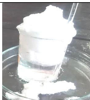
Fig1:Egg shell dissolve

Step 3: Estimation of Calcium oxalate by Titrimetry: Weighed exactly 1mg of the calcium oxalate and (10mg) of the Hajrul Yahood Bhasm and Pishti, Ashmarina (used 0.115gm) / Drotin tablet (0.0275) and packed it together in semi-permeable membrane for evaluation. This was allowed to suspend in a conical flask containing 100ml 0.1 M TRIS buffer. One group served as negative control (contained only 1mg of calcium oxalate). The conical flask of all groups placed in an incubator, preheated to 37^\circ\text{C} for about 7-8 hours. The contents of semi-permeable membrane removed from each group into a test tube. 2 ml of 1 N sulphuric acid added in each flask and titrated with 0.9494 N \text{KMnO}_4 till a light pink color end point obtained. 1ml of 0.9494 N \text{KMnO}_4 equivalent to 0.1898mg of 4 Calcium. The amount of un-dissolved calcium oxalate is subtracted from the total quantity used in the experiment in the beginning, to know how much quantity of calcium oxalate actually test substance(s) could dissolve.