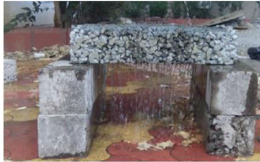
Fig. Arrangement for Permeability Test of Pervious Concrete Specimen