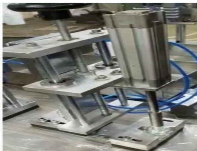
Fig. 4. Bunk Pressing

Fig.4 . shows that the Machine of construction of the Bunk press is MS. The jigs and fixture arrangement is used for the pressing of the bunk into the bottles. The movement of the jig is controlled by pneumatic cylinder.