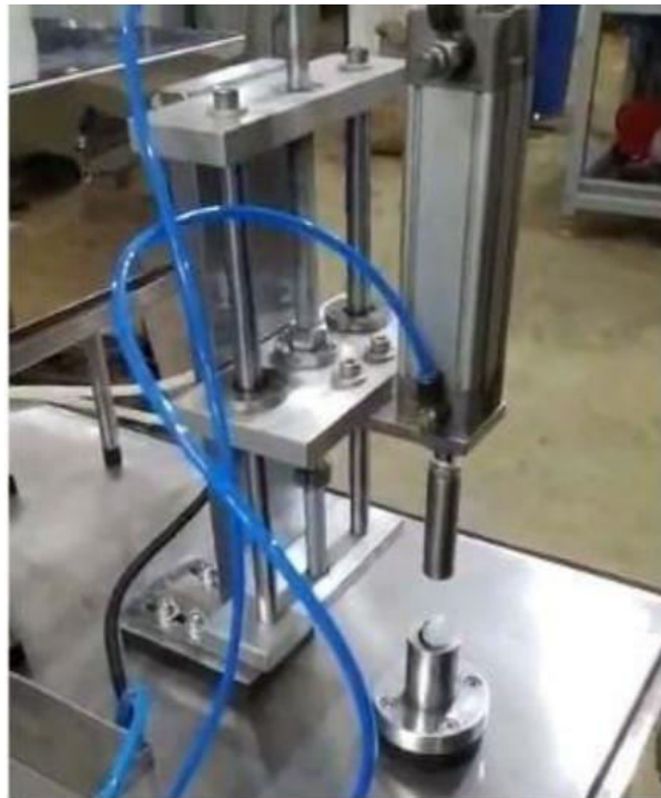
Fig. 3. Wick Pressing