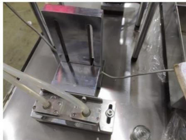
Fig. 2. Filling station

Fig.2 . shows that the filling unit has two nozzles connected by silicon pipe for free flow of liquid. The flow of liquid can be controlled by the setting in the filling machine