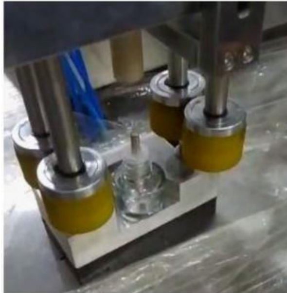
Fig. 5. Roller Capping