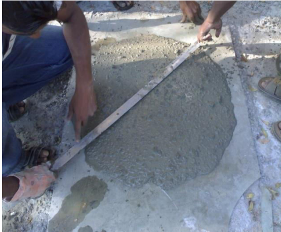
Slump flow EquipmentJ-Ring equipment