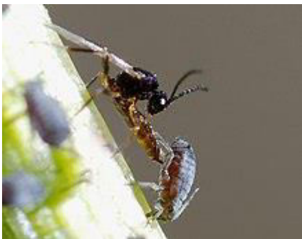
Parasitoid braconid wasp ovipositing in black bean aphid

Dispersal can be by walking or flight, appetitive dispersal, or by migration. Winged aphids are weak fliers, lose their wings after a few days and only fly by day. Dispersal by flight is affected by the impact, air currents, gravity, precipitation, and other factors, or dispersal may be accidental, caused by the movement of plant materials, animals, farm machinery, vehicles, or aircraft. [123]