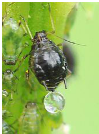
Aphid with honeydew, from the anus, not the cornicles

Plants exhibiting aphid damage can have a variety of symptoms, such as decreased growth rates, mottled leaves, yellowing, stunted growth, curled leaves, browning, wilting, low yields, and death. The removal of sap creates a lack of vigor in the plant, and aphid saliva is toxic to plants. Aphids frequently transmit plant viruses to their hosts, such as to potatoes, cereals, sugarbeets, and citrus plants. [28] The green peach aphid, Myzus persicae , is a vector for more than 110 plant viruses. Cotton aphids ( Aphis gossypii ) often infect sugarcane, papaya and peanuts with viruses. [20] In plants which produce the phytoestrogen coumestrol, such as alfalfa, damage by aphids is linked with higher concentrations of coumestrol. [115]