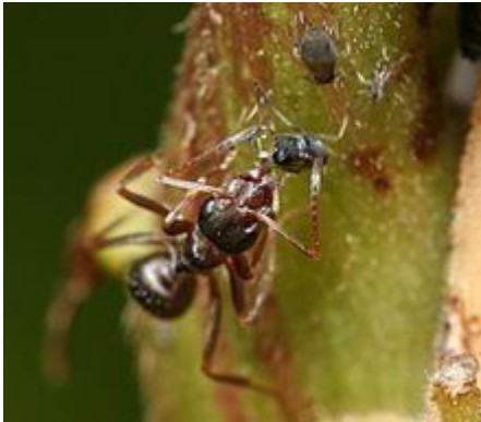
Ant extracting honeydew from an aphid

An interesting variation in ant–aphid relationships involves lycaenid butterflies and Myrmica ants. For example, Niphanda fusca butterflies lay eggs on plants where ants tend herds of aphids. The eggs hatch as caterpillars which feed on the aphids. The ants do not defend the aphids from the caterpillars, since the caterpillars produce a pheromone which deceives the ants into treating them like ants, and carrying the caterpillars into their nest. Once there, the ants feed the caterpillars, which in return produce honeydew for the ants. When the caterpillars reach full size, they crawl to the colony entrance and form cocoons. After two weeks, the adult butterflies emerge and take flight. At this point, the ants attack the butterflies, but the butterflies have a sticky wool-like substance on their wings that disables the ants' jaws, allowing the butterflies to fly away without being harmed. [70]