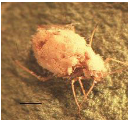
Green peach aphid, Myzus persicae , killed by the fungus Pandora neoaphidis (Entomophthorales)

For small backyard infestations, spraying plants thoroughly with a strong water jet every few days may be sufficient protection. An insecticidal soap solution can be an effective household remedy to control aphids, but it only kills aphids on contact and has no residual effect. Soap spray may damage plants, especially at higher concentrations or at temperatures above 32 °C (90 °F); some plant species are sensitive to soap sprays. [112][127][128]