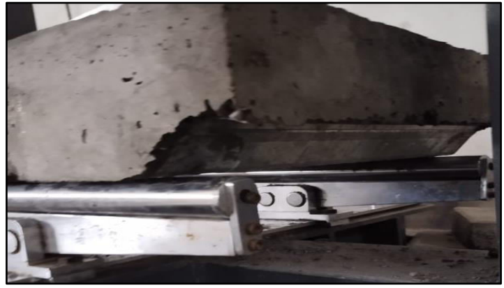
Figure 3b Cracking pattern of composite slab

On the other hand, the failure modes of composite slab can be categorized into 2 major modes under loading as shown in Fig. 3b which are flexural failure at mid span and bond or longitudinal slip failure. A bond failure results in slippage between the concrete and the metal deck, which can result in cancellation of the compositeactions at interface. In flexural failure mode, the full steel section can yield in tension before the crushing of concrete in the upper section.