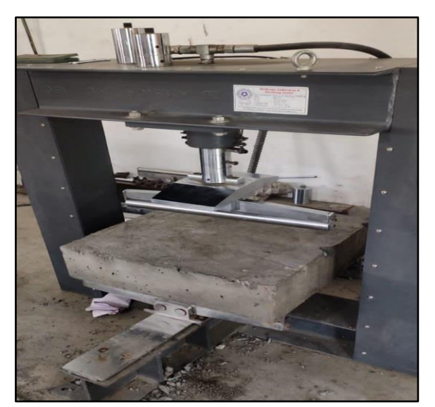
Figure 1b Testing of Specimen