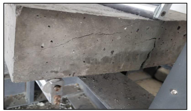
Figure 3a Cracking pattern of conventional slab

On the other hand, the failure modes of composite slab can be categorized into 2 major modes under loading as shown in Fig. 3b which are flexural failure at mid span and bond or longitudinal slip failure. A bond failure results in slippage between the concrete and the metal deck, which can result in cancellation of the compositeactions at interface. In flexural failure mode, the full steel section can yield in tension before the crushing of concrete in the upper section.