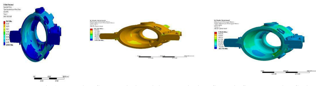
Fig 1 Von Mises Stress Fig 2 : Minimum Principal Stress in Steam Turbine Casing Fig 3 max principal stress

The objectives of this present work is to study the Linear static analysis, Steady state thermal analysis of casing of a steam turbine, Bolts optimization, Life evaluation of casing of a steam turbine under specified boundary