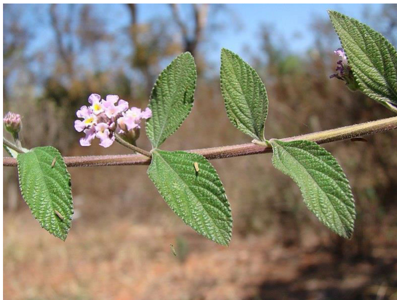
Lippia alba (Mill.) N.E.Br. - VERBENACEAE - Jardim Botânico de Brasília - Distrito Federal - Brasil.

The insects Sitophilus zeamais and Tribolium castaneum cause losses in stored grains and are considered pests of wide distribution and global significance. The toxicity and repellency of essential oils of different Lippia alba genotypes (carvone chemotypes LA-13 and LA-57 and citral chemotypes LA-10 and LA-44) and their major monoterpenes, carvone and citral, on S. zeamais and T. castaneum . For S. zeamais , the monoterpene citral had the lowest lethal time ( LT_{50} = 6 h), whereas for T. castaneum , the monoterpenes carvone and citral showed a more rapid toxicity ( LT_{50} = 7.3 h). The compounds tested were highly repellent to T. castaneum ; however, no repellency's effect was observed against S. zeamais , except for LA-13 chemotype. The essential oils from the carvone chemotype and the monoterpene carvone have potential for the development of natural insecticides [10] against stored grain insects S. zeamais and T. castaneum . [11]