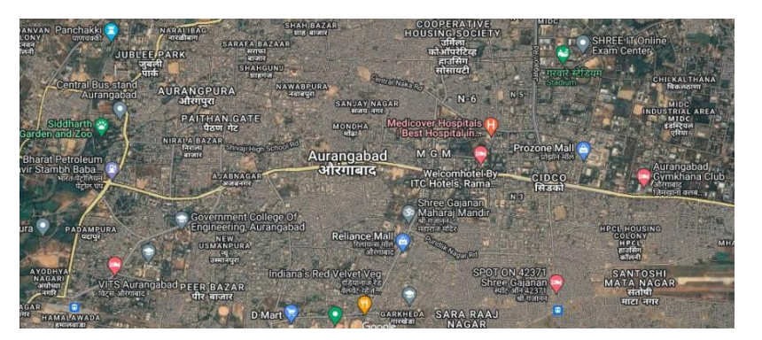
Fig1: Map showing location of Aurangabad city.

Aurangabad is one of fast growing, renowned industrial hub of Maharashtra. The district has geographical area of 10,107 sq.km, out of which 726 sq.km is occupied by forest while cultivated area is 8135.57 sq.km and net area sown is 6540 sq.km. The area is covered by the Deccan trap lava flows of upper cretaceous to lower Eocene age. This district is surrounded by Jalgaon district of North, Nashik district in west, Ahmednagar, and Beed district in south and Parbhani and Buldhana district in east. Aurangabad district has been divided in nine talukas viz. Aurangabad, Kannad, Soyagaon, Sillod, Phulambri, Khultabad, Vaijapur, Gangapur, and Paithan talukas. The climate of the Aurangabad district is generally characterized by a hot summer and a general dryness throughout the year except during the south west monsoon season, which is from June to September while October and November constitute the post-monsoon season. About 83% of annual rainfall is received during June to September. In the present today soil samples from areas namely S1 to S10 from Aurangabad city are collected and analysed. Generally soil pH is determined using glass electrode pH meter EC by conductivity bridge (5)as described by Piper available nitrogen by alkaline permanganate method and the potassium by flame photometer. pH, EC, Nitrogen, phosphorus, and potassium are supportive parameters in the organic carbon, Organic matter and bulk density of soil.