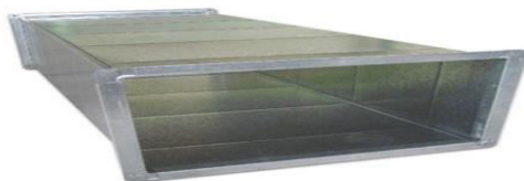
Fig 3: Rectangle Duct

Ducts are commonly framed by collapsing sheet metal into the necessary shape. The most widely recognized shapes, around, rectangular, and oval pipes.