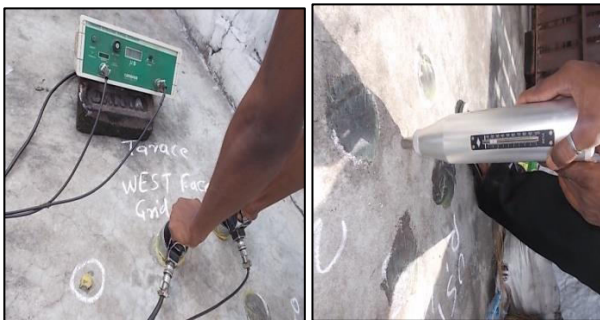
Figure1.2: Testing Apparatus