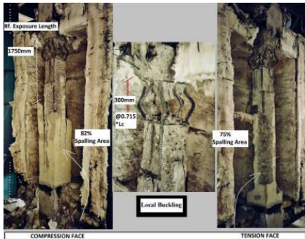
Fig1.1: Column of Compression and Tension Face

Concrete structures are well-known for their fire resistance. There haven't been many reported cases of severe structural failure caused by the collapse of individual walls, beams, or columns. However, as buildings are designed with lower safety margins and higher strength concretes, this may change. When a fire breaks out in a building, the walls must be reinforced to limit the spread of fire and maintain structural adequacy.