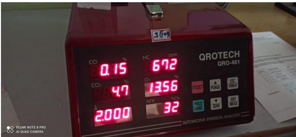
Fig: 2 Emission test

To perform the Emission characteristics test, we made use of “Automotive Emission Analyzer (QRO-401 Series)” from Vemana Institute of Technology which is shown below.