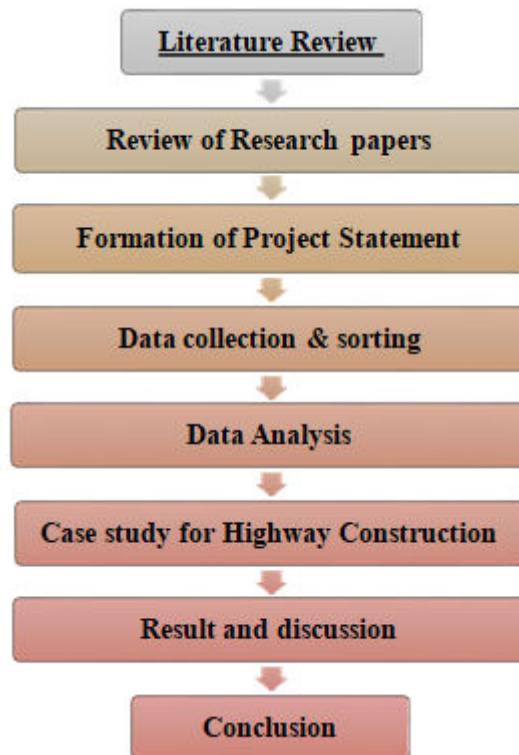
Figure: Methodology chart

Step 4: Monetizing Converting each of the costs and benefits to a common unit allows for the direct comparison of costs to benefits