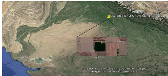
Fig.3.1: Aerial View of the Location

The pond selected for installing floating solar photovoltaic power plant is located in Khurana, Haryana with a latitude of 29.857973N and longitude of 76.414772E, and an altitude of about 233 m above sea level. The pond is 62 m \times 62 m in size, and it covers an area of around 3844 m 2 at a depth of about 3 m. The space chosen for the PV plant is 22 m \times 27 m, giving it an area of roughly 594 m 2 . Fig 1 shows the aerial view of location. Also, for overland solar photovoltaic power selected area is at Khurana, Haryana.