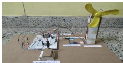
Fig 3- Implementation Final Model

Figures a, b, c where (a) Serial monitor screen showing the packets sent by LoRa sender.(b) Serial monitor screen showing the packets received by LoRa device. (c) Android application screen which shows various parameters details being fetched from sensors.