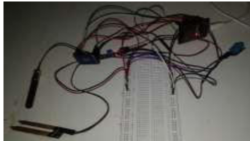
Fig-1 LoRa sending kit