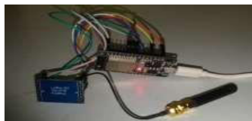
Fig-2 LoRa receiving kit