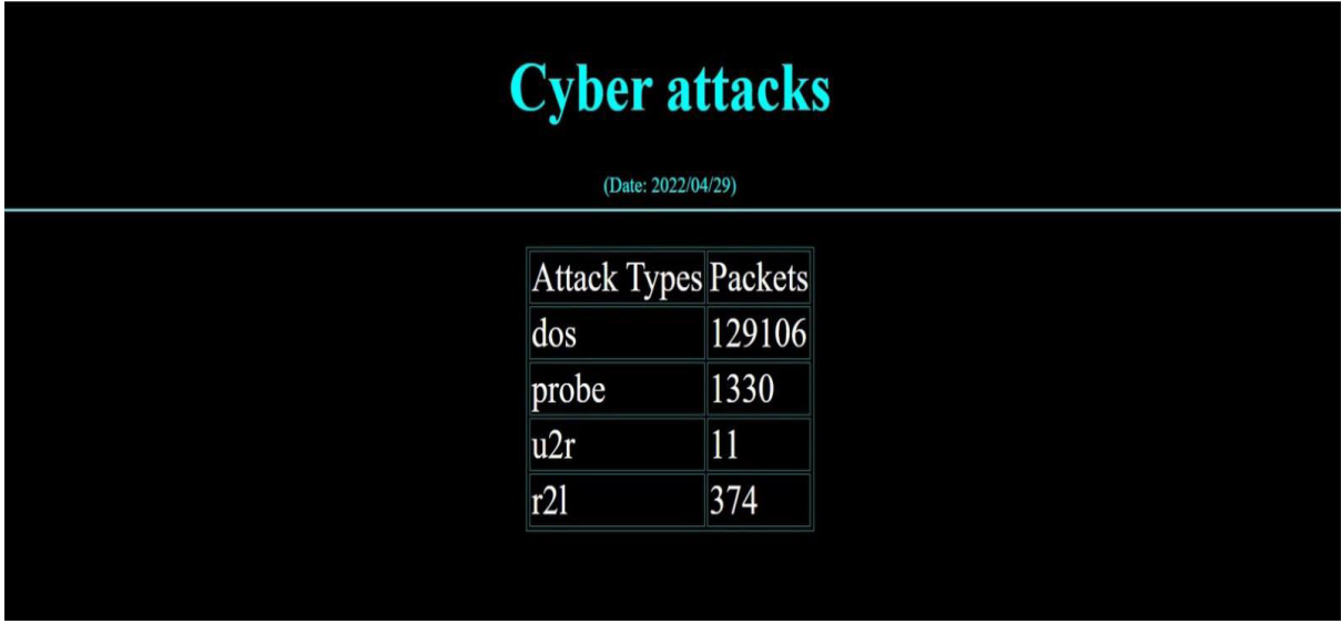
Fig 2: Cyber Attack