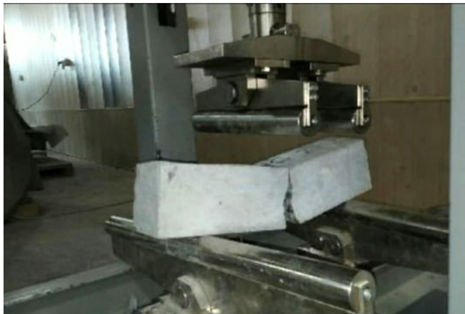
Figure 4: Flexural failure of rubberized concrete