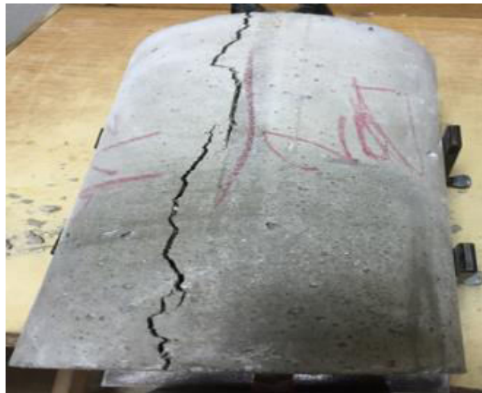
Figure 3: Splitting failure for 18% replacement by coarse aggregate concrete specimen