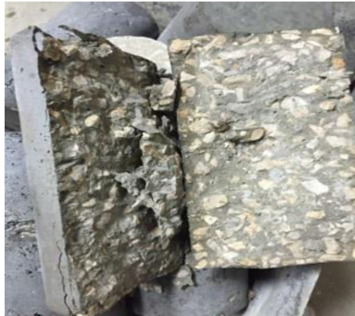
Figure 2: Splitting failure of normal PCC lean mix concrete specimen